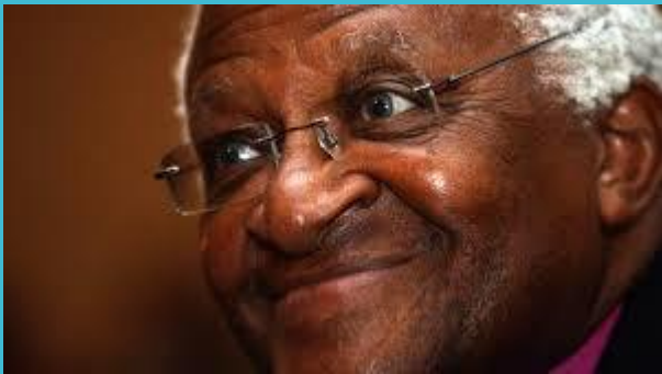
Archbishop Desmond Tutu

Regardless of what you might choose for yourself, why should you deny others the right to make this choice?